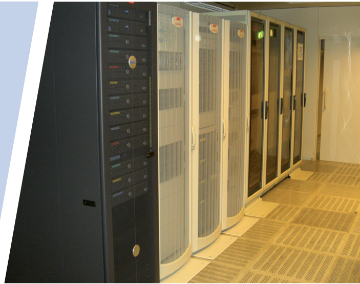
Server based creation of PDFs with the PC-WARE PDF Client.